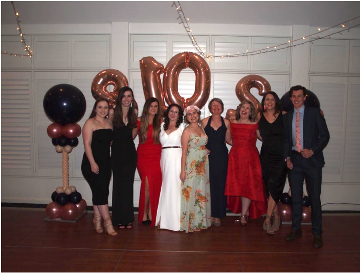
2018 PhUNE Committee