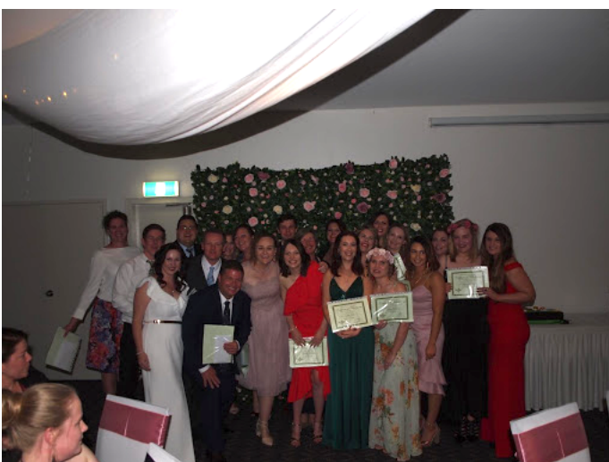
UNE Pharmacy Class of 2018