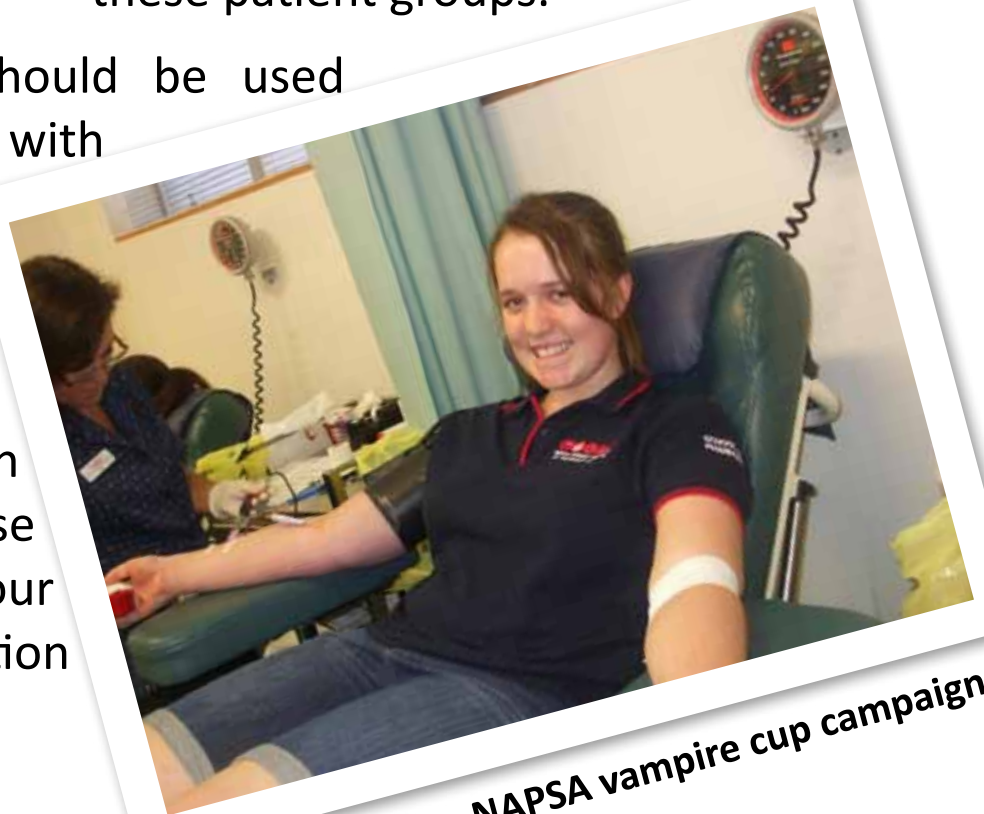
Picture from NAPSA vampire cup campaign

This newsletter should be used in conjunction with other campaign materials and will collectively provide you with information on how to organise and establish your own blood donation campaigns.